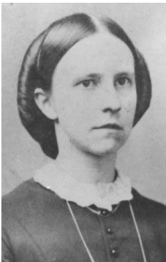
Olympia Brown. Read more about her at www.uua.org/uuhs/duub/articles/olympiabrown.html