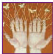
Whatsoever You Do (Information on Talbot County's humanitarian groups)

Just click on the symbol to see their web page.