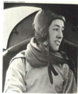
Anne Morrow Lindbergh